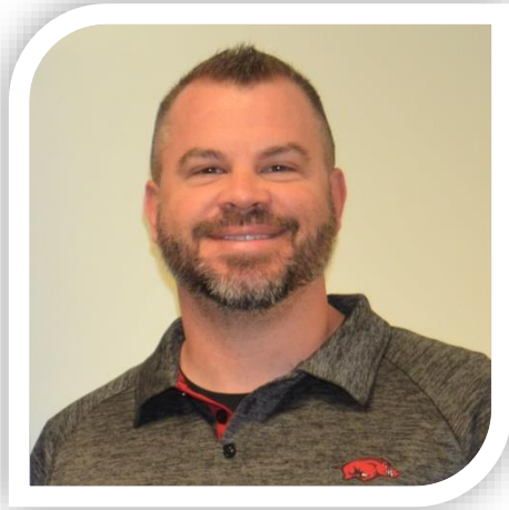
Financial Analyst I Office of Accounting

What's something you find challenging about your work? The accounting side of my job is challenging. I was a Resource Adviser for some of my time in the Air Force, so I am familiar with how accounting works, but state accounting is a completely different animal.