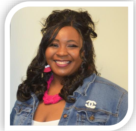
Financial Support Analyst DFA Revenue Services Division