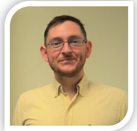
Hearing Officer DFA Revenue Services Division

How long have you worked at DFA? Sixteen years.