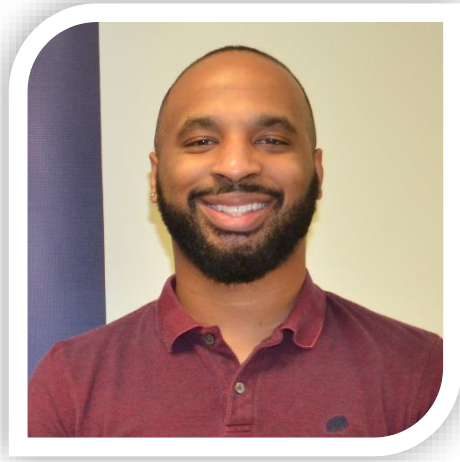
Grants Analyst Office of Intergovernmental Services

How long have you been working with DFA? Two years.