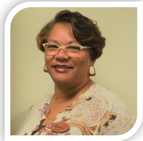
DFA Local Revenue Office Manager DFA Revenue Services Division