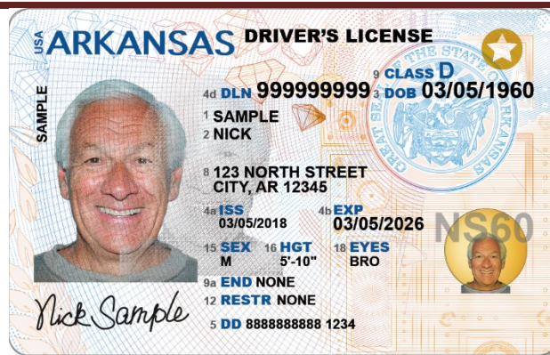
(REAL ID Driver's License)

Effective October 1, 2019 there is a wholesale sales tax on motor fuel for an additional 3 cents on gasoline and 6 cents per gallon on diesel. Act 416 was passed in the 92 nd General Assembly Regular Session of 2019. This Act will increase the overall tax rate for Motor Fuel to 24.5 cents a gallon for gasoline and 28.5 cents a gallon for diesel.