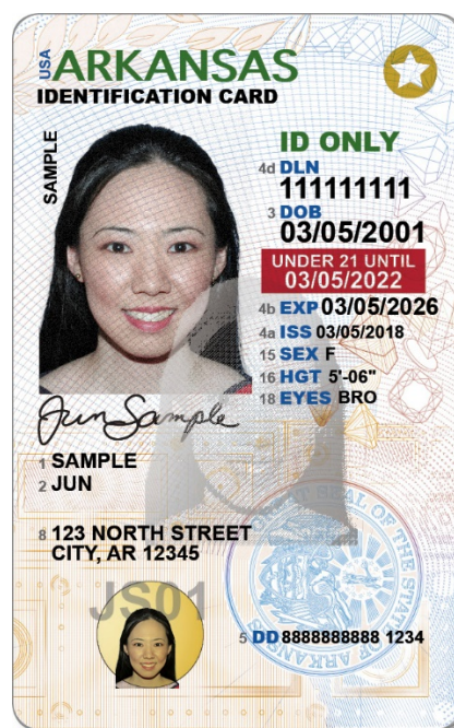
(REAL ID Identification Card)

For more information on reporting suspicious activity, please contact the Office of Field Audit by phone at 501-682-4616 or email at FieldAudit@dfa.arkansas.gov .